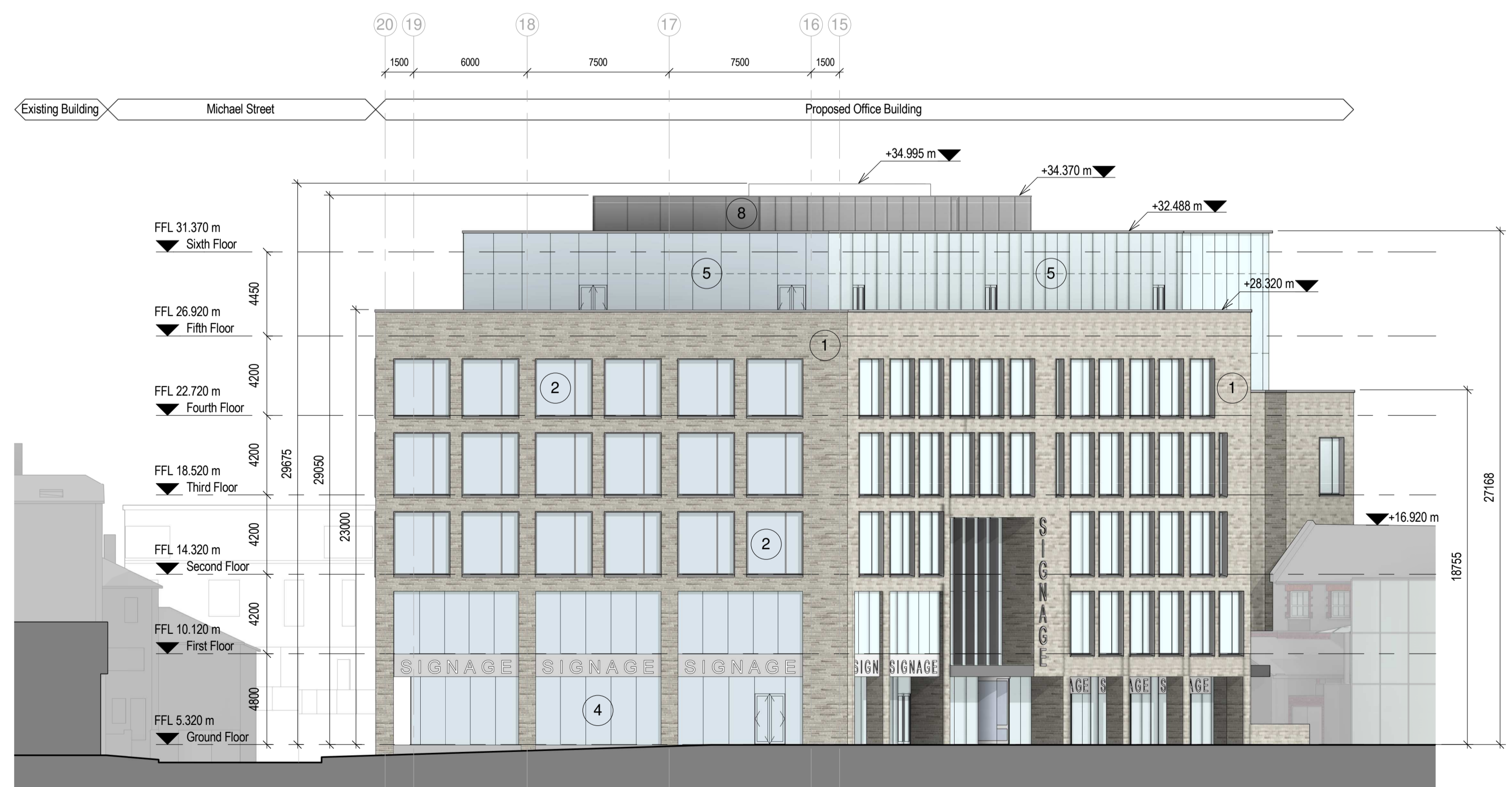
2 Parcel 01 - Proposed North Elevation to Public Square 1:200